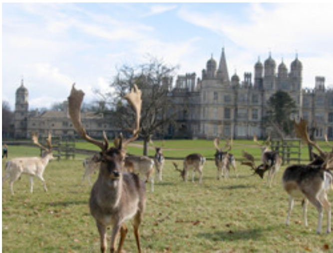
BURGHLEY HOUSE - Burghley House, England's largest and grandest house, substituted for the pope's residence and other scenes in the film. Lunch is offered in the restaurant, featuring venison supplied by deer that graze the grounds.