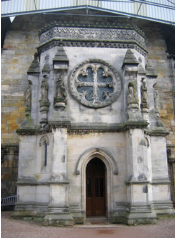
ROSSLYN CHAPEL - Rosslyn Chapel is a 15th century structure where Tom Hanks and Audrey Tautou uncover the truth of the holy grail in "The Da Vinci Code." The chapel is exquisitely carved and the artwork is full of biblical, Masonic, pagan and Knights Templar themes.