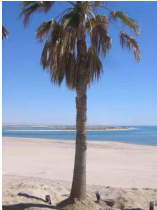
SAND AND SEA - The Sonoran Desert is also its largest beach, running into the sea.

Sustainable living is a major concern of the builders and a requirement of the Mexican government to insure the beauty, cleanliness and ecology of the area. New waste-processing plants also protect the beach and waters and some developers have built desalination plants to insure the fresh-water supply.