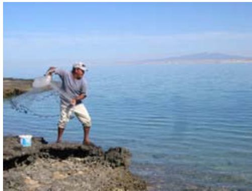
LIFE ON THE BAY - A fisherman casts his net into the beautiful bay of Puerto Penasco.

Recently the pristine beaches north of Puerto Penasco have been discovered by affluent Americans, tourists and speculators, and the beachfront property has all been sold to large developers.