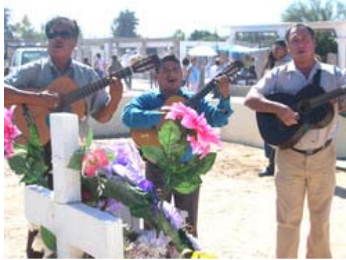
REMEMBERING LOST LOVED ONES - On the Day of the Dead, the departed are feted in cemeteries with feasts, drink and music, serenading them with their favorite songs.

Just driving among the black, purple and white cinder soils on lava and sand roads through endlessly changing colored landscapes of creosote bush, yellow chollas plants and humanlike saguaro cactuses beckoning travelers, the Sonora desert invokes the imagination and fantasy.